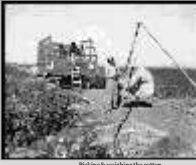
Picking & weighing the cotton

Can a machine make a difference? Read to find out how?