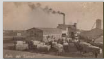
click on the picture

Resources 4 Educators THE PORTAL TO TEXAS HISTORY