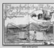
click on the picture

Resources 4 Educators THE PORTAL TO TEXAS HISTORY