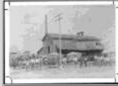
click on the picture

Resources 4 Educators THE PORTAL TO TEXAS HISTORY