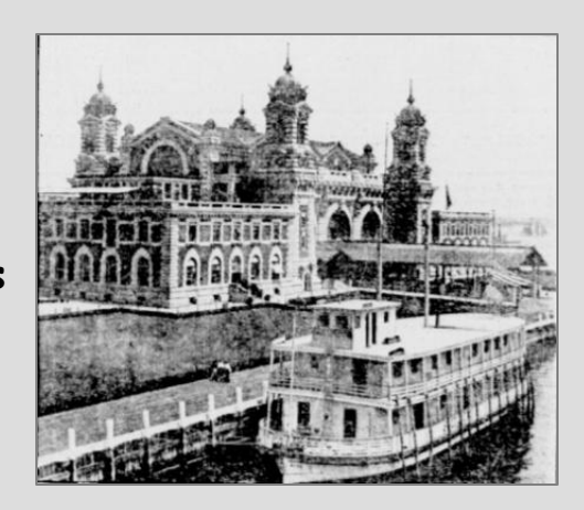
New York Tribune, August 28th 1904