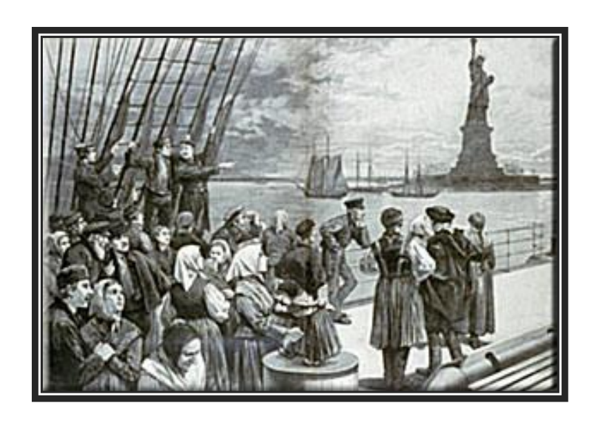
Ellis Island Click on Picture to see Video