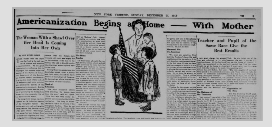
Permalink #2: Americanization Begins at Home with Mother

"men and women with boys and girls struggle with the proper sound of (w)e in the personal pronoun 'we'...".