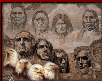
Click on picture