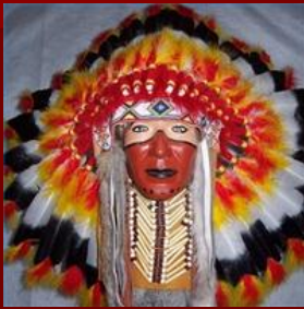
Click on picture

Lived in the mountains near the Rio Grande River