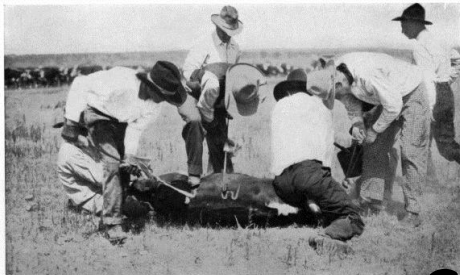
Branding, Dehorning, Castrating, Vaccinating and Marking Ear by Underclipping in left, at age three weeks to three months, all white Cattle. Call back to normal in 30 to 33 days.