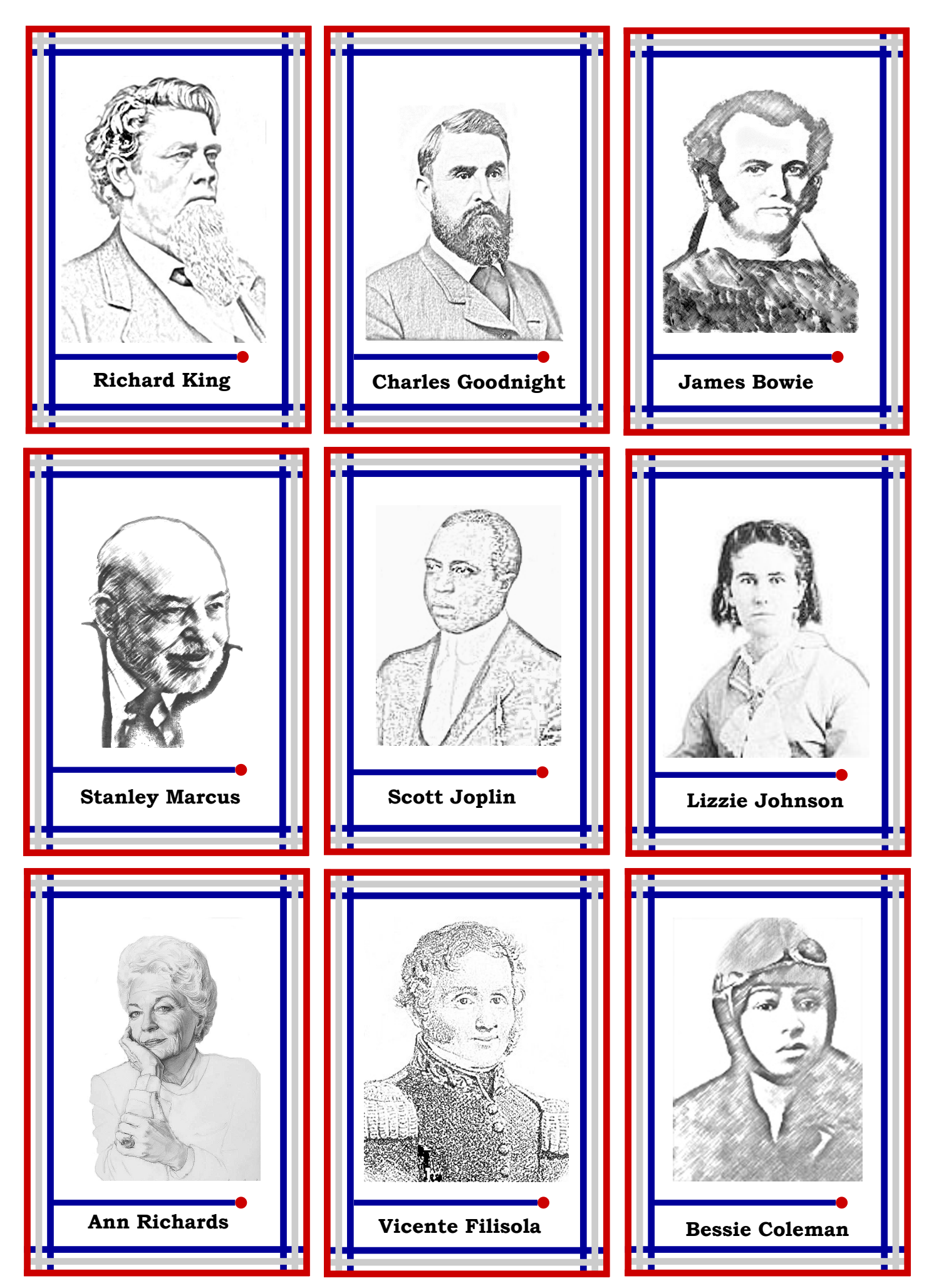
UNIVERSITY OF NORTH TEXAS AA