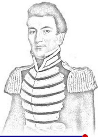
Juan Nepomuceno Seguín