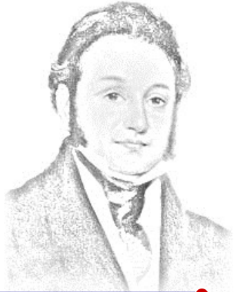
Lorenzo de Zavala