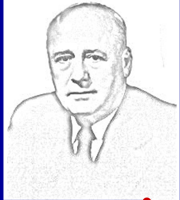
Samuel T. Rayburn