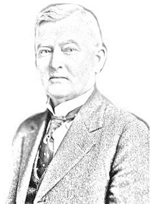
John N. Garner