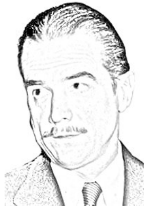
Howard Hughes Sr.