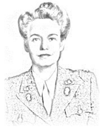
Oveta Culp Hobby