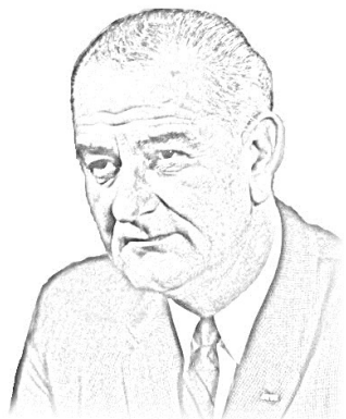
Lyndon B. Johnson