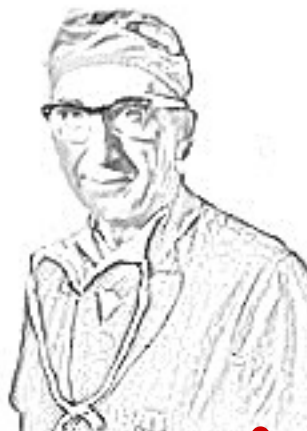
Michael E. DeBakey