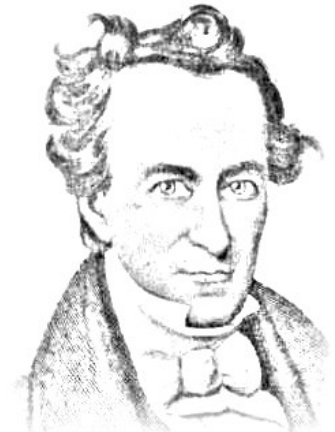
Stephen F. Austin