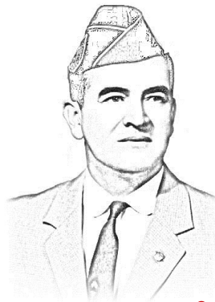
Hector P. Garcia