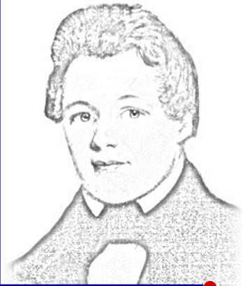
George C. Childress