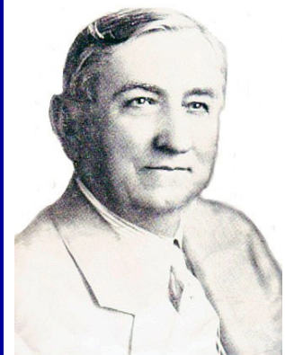
C. M. "Dad" Joiner