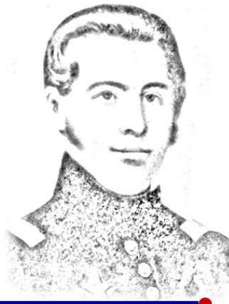
William Barrett Travis