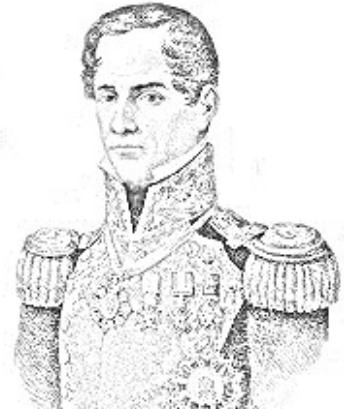
Antonio López de Santa Anna