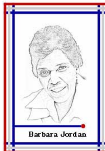
Barbara Jordan (1934 — 1996)