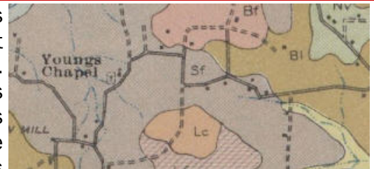
Detail of Red River County Soil map, 1923.

Published from 1901-1948, these surveys are now online at the Portal to Texas History SM , providing detailed information covering over 100 Texas counties.