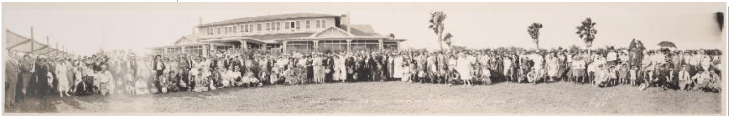
Watermelon Feast at Sharyland during the Convention of the Texas Press Association at Mc Allen, 1921