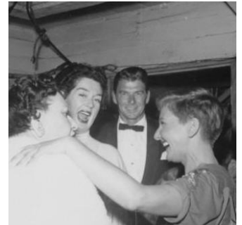
Ronald Reagan and Mary Martin