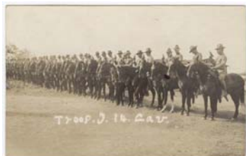
Troop J, 14th Cavalry, Ft. McIntosh, c. 1900, Laredo Public Library