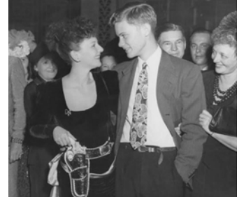
Mary Martin and her son, a very young Larry Hagman—before his J. R. days