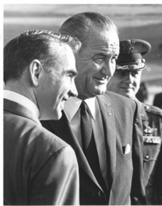
Jim Wright and LBJ