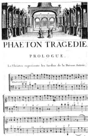
Phaëton. Tragedie mise en musique , Jean Baptiste Lully, 1709