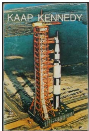
Bezoek aan Kaap Kennedy, by Franco-Suisse, 3 3/8" high