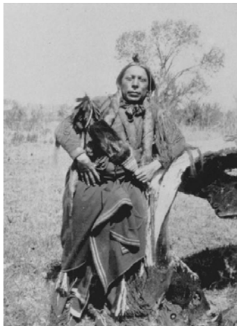
Comanche Jack Clay County Historical Society

Mission Statement: The Portal to Texas History SM offers students and lifelong learners a digital gateway to the rich collections held in Texas libraries, museums, archives, historical societies, and private collections. The Portal team at the University of North Texas provides strong leadership by supporting collaborative efforts with its partners, while pursuing the goals of accessibility, best practices, and preservation of historical material.