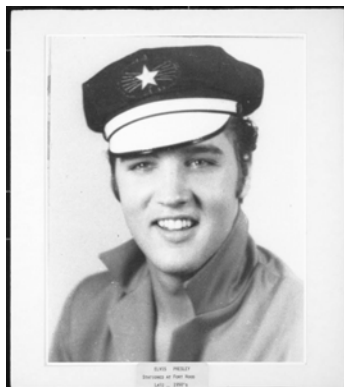
Elvis Presley at Ft. Hood, c. 1950s