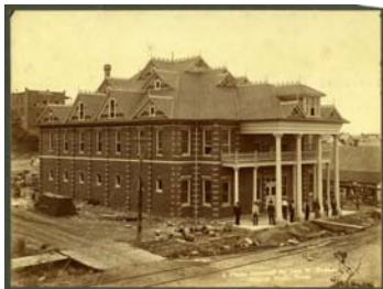
St. Nicholas Hotel, c. 1910. Boyce