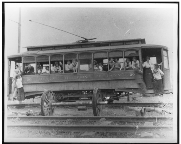
Denton streetcar, c. 1910, from the UNT Archives

Learn important tips for navigating through his-