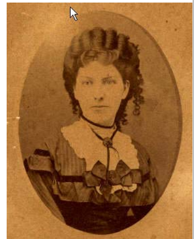
Conway Family Photos Palestine Public Library

was incorporated as a city in 1846, and photos will include images of early settlers and businesses, with some photographs dating from the Civil War era. The collection also features images of all the Palestine Mayors.