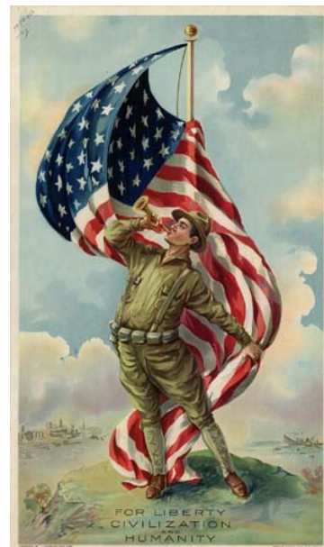
World War I Poster

Since the Primary Source Adventures are online, they are freely accessible 24 hours a day. Materials can be shown on audio visual equipment in the classroom, or downloaded and printed as convenient handouts.