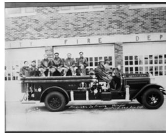
Hereford Fire Dept., 1928

This project was supported in part by Humanities Texas, the state partner of the National Endowment for the Humanities.