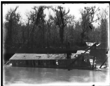
Sinking of the snagboat Trinity, February 13, 1910.

Mission Statement: The Portal to Texas History offers students and lifelong learners a digital gateway to the rich collections held in Texas libraries, museums, archives, historical societies, and private collections. The Portal team at the University of North Texas provides strong leadership by supporting collaborative efforts with its partners, while pursuing the goals of accessibility, best practices, and preservation of historical material.